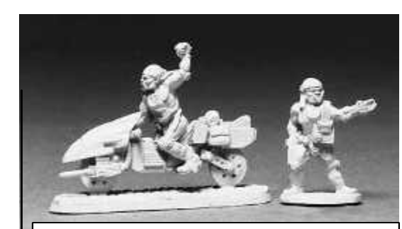
20-521 Ork Biker Std. & Mtd. was $6.50, now $5.20