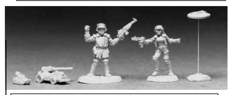
20-524 Riggers & Drones (5) was $7.75, now $6.20

20-542 Go-Gang Enforcers (Male & Female) on Scorpions (2) was $6.00, now $4.80