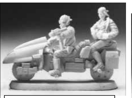
20-542 Go-Gang Enforcers (Male & Female) on Scorpions (2) was $6.00, now $4.80