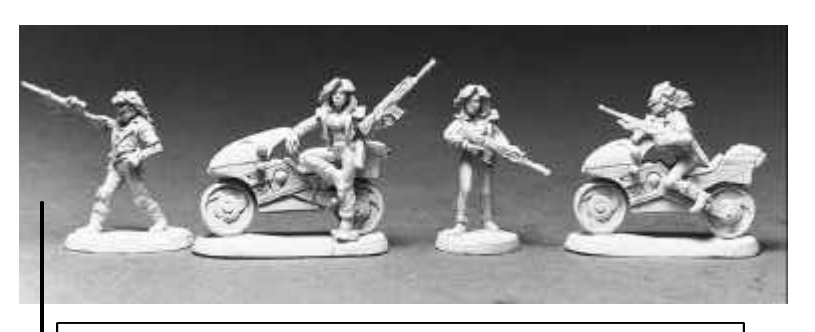
20-507 Go-Gangers (4 Characters, 2 Bikes) was $9 .25, now $7.40

Ral Partha, in co-operation with TSS Productions, is making this special offer available only through the The Shadowrun Supplemental. In keeping with the theme of the issue, the following Ral Partha Official Shadowrun Miniatures are being offered at a 20% discount for a limited time. For the full line of Shadowrun miniatures, visit the Ral Partha web site at www.ralpartha.com.